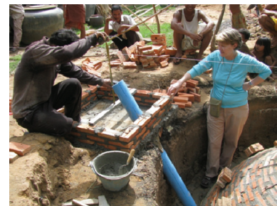
Biodigester under construction in Pursat, Cambodia.

The Bioenergy and Sustainable Technology Laboratory is working on the design of a digesting toilet as a pre-fabricated kit that can be quickly deployed for use in natural disaster situations. Design parameters include easy deconstruction and reconstruction, and use of off-the-shelf materials and basic tools. This will be an important device not only for the victims of natural disasters, but also for first responders that find themselves lacking all basic services while trying to provide life saving attention to the victims.