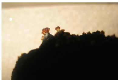
Fruiting bodies (~ 1 mm in size) of Nectria sp. fungus found in an aerobic mesocosm.