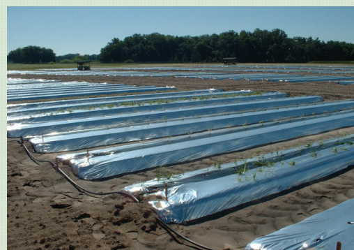
Tomato beds after fumigation and transplanting at UF Plant Science Education and Research Unit, Citra, FL