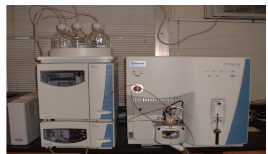
TSQ Quantum Discovery Max LC-MS/MS