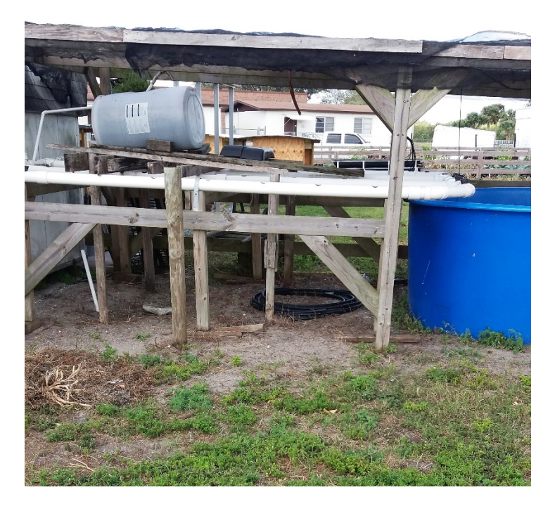
Fig. 2 Student Constructed Aquaponics System at Yearling Middle School, Okeechobee, FL

The method recommended in this curriculum is a hybrid system in which the plants will be rooted in shallow cups filled with medium while the root structures will be suspended below in constant flow of nutrient film.