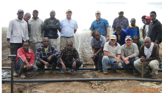
A happy group of researchers and students from UF/IFAS, Embrapa (Brazil), and Mozambique after jointly setting up field experiments in Mozambique.