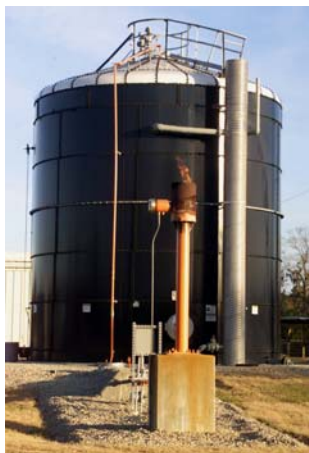
Fixed-Film Anaerobic Digester designed by Ann Wilkie

The DRU fixed-film biogas digester is partially filled with media, which provides a large surface area for bacterial attachment. This enables stable biogas production at low hydraulic retention