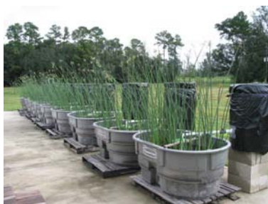
Constructed wetlands for dairy effluent treatment