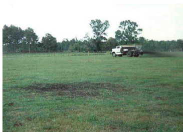
Land application of biosolids