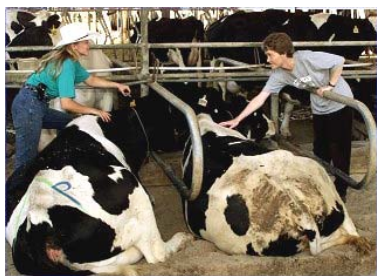
At the Dairy Research Unit