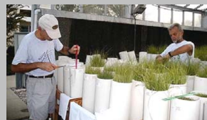
Bahiagrass harvesting from greenhouse studies of biosolids amended soils

Land application of biosolids (municipal sewage sludge treated to reduce pathogen hazards) is common in Florida, especially on pastures. Biosolids contain organic matter and nutrients that are beneficial to the soil-plant system, and application rates are commonly based on crop nitrogen (N) needs. Such rates, however, typically simultaneously supply phosphorus (P) in excess of crop P needs. This can lead to P accumulation in amended soils and the potential for P-related water quality problems if the biosolids-P contaminates surface water bodies. The Water Environment Research Foundation (WERF) funded a two-phase project entitled "Characterizing Forms, Solubilities, Bioavailabilities, and Mineralization Rates of P in Biosolids, Commercial Fertilizer, and Manures" to evaluate the agronomic and environmental impacts of biosolids compared to impacts from P in manure and fertilizer. The research is a cooperative effort of SWS personnel and personnel at Pennsylvania State University.