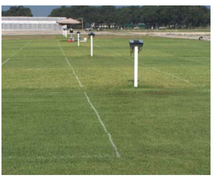
FDEP Environmental Plots—Towers represent collection points for buried lysimeters

Milorganite, GreenEdge), lend themselves to easy application on urban lawns, and are favored products for golf course greens. See Biosolids Page 4