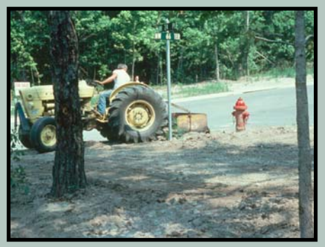
Burial of surface soil under fill material

Determined gardeners can battle alkaline soils using elemental sulfur and organic soil amendments, but they should prepare themselves for a long and costly effort. For further information, contact Tom Obreza at taob@ifas.ufl.edu