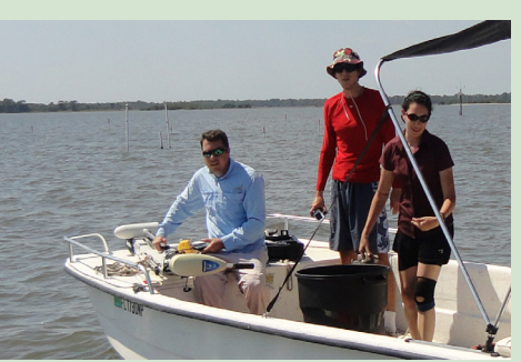
Subaqueous soil study with hard clam (Mercinaria mercinaria) aquaculture extension in Cedar Key FL

carbon sequestration via spodic horizons, spatial patterns of hydric soil indicators), and improving wetland quantification/delineation both on-site and off-site. All projects are enhanced via Geographic Information Systems (GIS),