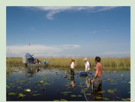
Soil and water quality sampling in Everglades National Park.

The Everglades restoration effort is a nexus of ecology, hydrology, biology and chemistry applied to restoration of a diverse and unique ecosystem, and as such, is a central focus of Osborne's research program.