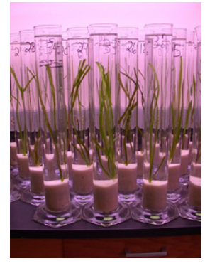
Vallisneria americana toxicity assay

Environmental Toxicology and Risk Assessment: Research and extension programs focus on: (1) identifying how land and water management (i.e., horticultural/agricultural crop production, urban development, etc.) impacts water quality and natural resources, and (2) identifying strategies to minimize negative impacts on natural resources. Primary interests are related to organic pesticides and emerging contaminants. Current research interests include: risk identification for sea grasses and other aquatic organisms exposed to pesticides from the surrounding Indian River Lagoon watershed, determination of potential interactions and effects of mixtures of pesticides and other emerging contaminants on the toxicity to aquatic plants and animals, and determination of the potential for bioaccumulation of endocrine disrupting compounds in food crops irrigated with reclaimed municipal water. Extension program focuses on helping stakeholders identify (1) the relationship between their land/water management practices and potential impacts on water quality and natural resources, and (2) methods for minimizing negative impacts. For details contact Chris Wilson at: pcwilson@ufl.edu.