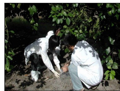
Soil sampling for Cu contamination evaluation

Soil Biogeochemistry of Nutrients and Contaminants: Research focuses on biogeochemistry of nutrients and contaminants, development of BMPs for sustainable agriculture in South Florida, remediation of contaminated soil and water resources, and nutrient/waste management to enhance fertilizer use efficiency and water quality. The outcomes are expected to improve the understanding and/or advance knowledge in chemical interactions of nutrients and contaminants, organic/inorganic transformation reactions, and interfacial processes in soil, to facilitate the development of BMPs beneficial to humans and the environmental health in the Indian River area and South Florida. For details contact Zhenli He at: zhe@ufl.edu.