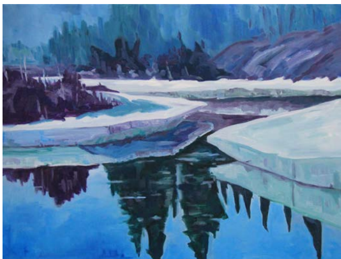
Drip Drop Spruce River 18 x 24" acrylic on canvas