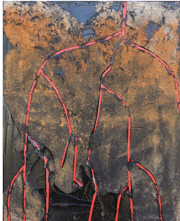
Water as our Lifeblood 24 x 30" Mixed media (soil and acrylic) on canvas. This work from northern Saskatchewan tells the story of water percolating through the soil with river channels painted red to draw the parallel with blood flowing through our veins.

With his deep knowledge of soil, he also wanted to incorporate that into his art. With an interesting soil profile in front of him, Van Rees would press a small canvas thick with paint into the soil for a mixed-media effect. He and his students also created finely-ground pigments with different colored soils that were ready for the canvas.