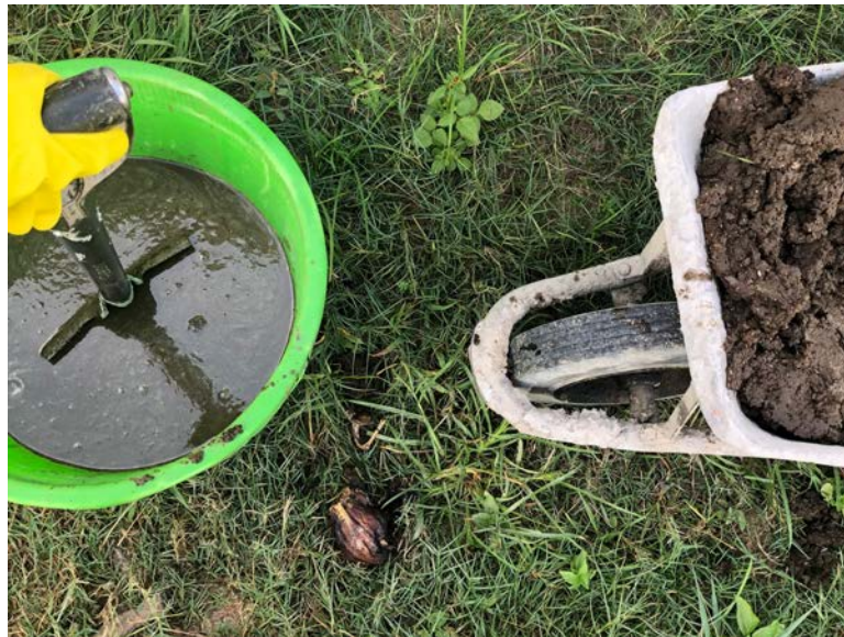
To build the microbiome in the anaerobic digester, Claverie added a mix of manure from the local village and water.

Claverie's work is not exclusive to the field. She is trying to bring biogas to the villages as well.