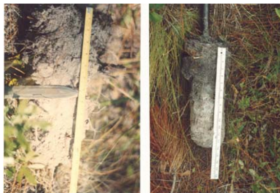
Fig. 2. Upper soil profiles from Site 1 (left) and Site 2 (right).

indicator. A stripped matrix occurs at a depth of 16 cm and seasonal saturation is expected there.