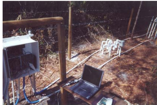
Fig. 6. Data are downloaded from the datalogger to a laptop and imported into a spreadsheet.

A serial port (Fig. 6) on the datalogger is periodically connected to a laptop computer to download the data via an interface between the computer and the datalogger. The air temperature sensor and the KCL reference electrode are located beneath the control box. Ultimately, results will augment soil classification (Soil Survey Staff, 1999) and hydric soil standards (NTCHS, 2000).