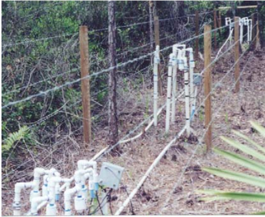
Fig. 4. Overview of Sites 2 (front), 3 and 4 after instrumentation.

1999) requirements for aquatic suborders/subgroups are met; one slotted PVC well at a depth of 2 meters to record local hydrology patterns; c) one thermocouple at a depth of 50 cm and one at a depth of 100 cm to determine temperature regime according to the current and proposed Soil Taxonomy requirements; and d) five platinum electrodes at a depth of 12.5 cm to determine if the NTCHS standard for reduction is met. The fence (Fig. 4) was added to minimize human and fauna traffic across the instrumented area.