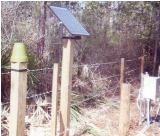
Fig. 5. Rain gage, solar panel, and datalogger (left to right).

Rain (Fig. 5, left) and air temperature recorders were also installed to coordinate rainfall data with hydrology data and air temperature with soil temperature. All instrumentation is connected to a control panel and from there to the datalogger (Fig. 5, right) that is powered by a 12-volt battery that is charged by a solar panel (Fig. 5, center).