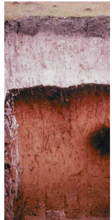
Myakka (the Seminole word for “big waters”) gives a special identity to our Department, as it is also the name of Florida’s State Soil, Myakka fine sand.

Since your work rarely gets widespread public notice, I’m gratified to see that the United Nations has declared 2015 the International Year of Soils . Congratulations, SWSD, for your outstanding accomplishments and on your year in the spotlight. Keep up the good work!