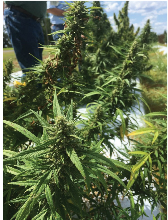
Figure 2. UF/IFAS hemp field day.

commercialization of hemp production ( https://www.ams.usda.gov/rules-regulations/hemp ).